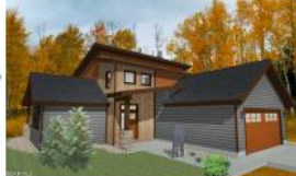
A single-family cabin.

then take the first left and follow signs into Granby Ranch's New Home Sales Center.