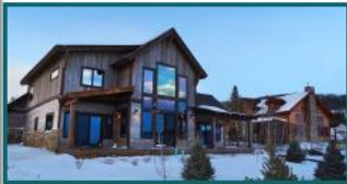
A custom home at Granby Ranch.

Granby Ranch's new ski-in/ski-out designs include 3-bedroom townhomes with garages (upper left) from the $890s, and single-family cabins (below), 4-bedroom with a main-floor master. Some homes are set for move-in this ski season.