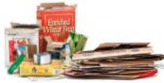
Flattened Cardboard & Paperboard Cartón y cartulina aplastados

✗ DO NOT INCLUDE IN YOUR MIXED RECYCLING CONTAINER / NO INCLUIR EN SU CONTENEDOR DE RECICLAJE MIXTO