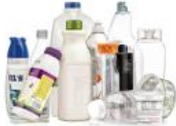
Plastic Bottles & Containers Botellas y envases de plástico