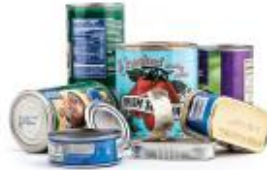
Food & Beverage Cans Latas de alimentos y bebidas