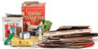
Flattened Cardboard & Paperboard Cartón y cartulina aplastados

✗ DO NOT INCLUDE IN YOUR MIXED RECYCLING CONTAINER / NO INCLUIR EN SU CONTENEDOR DE RECICLAJE MIXTO