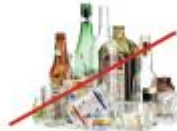
NO Glass Bottles & Containers NO botellas y envases de vidrio