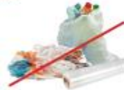
NO Loose Plastic Bags, Bagged Recyclables or Film Empty recyclables directly into your bin. NO bolsas y envolturas de plástico sueltas, o materiales reciclables embolsados Vacíe directamente los materiales reciclables en nuestro carrito