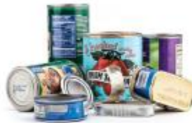
Food & Beverage Cans Latas de alimentos y bebidas